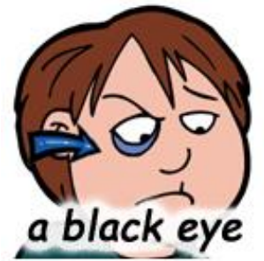
a black eye