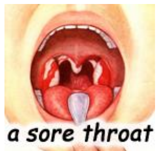
a sore throat