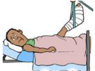
a broken leg