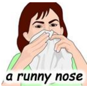
a runny nose